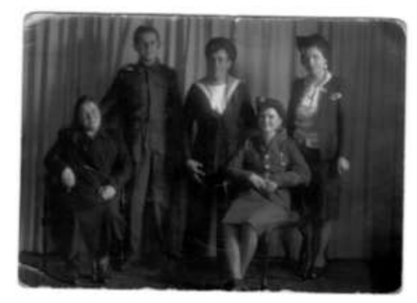
Jims Parents Wedding Day WW2

I was not interested in learning anything, which when I look back was a big mistake. I had to be re educated once I joined the army. The reason for joining the army was to emulate those who had been in before me.